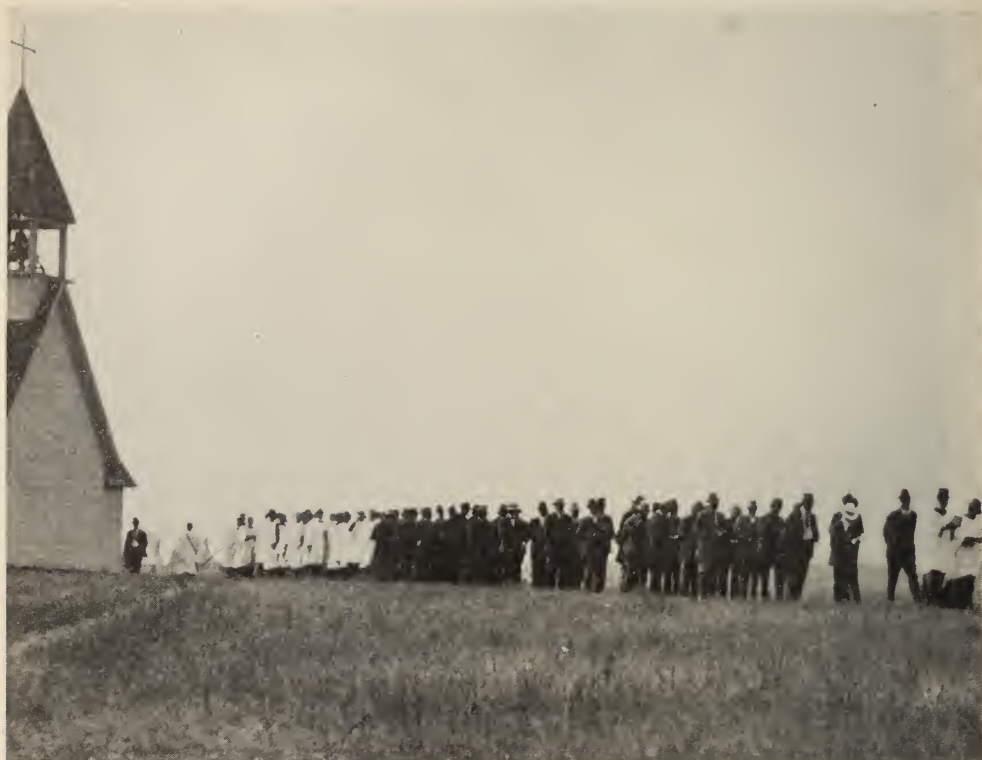
THE PROCESSION OF CHOIR, NATIVE WORKERS AND